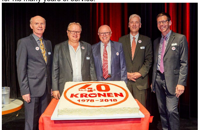
The management team was expanded in the anniversary year 2018.